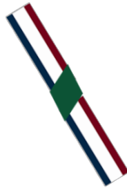
Figure 4 Unit 2 - WRONG

Also the orientation of the blocks has been correct!