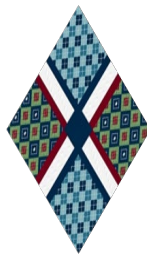
Figure 7 Block 3