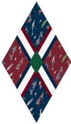
Figure 5 Block 1

Also the orientation of the blocks has been correct!