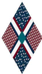
Figure 6 Block 2