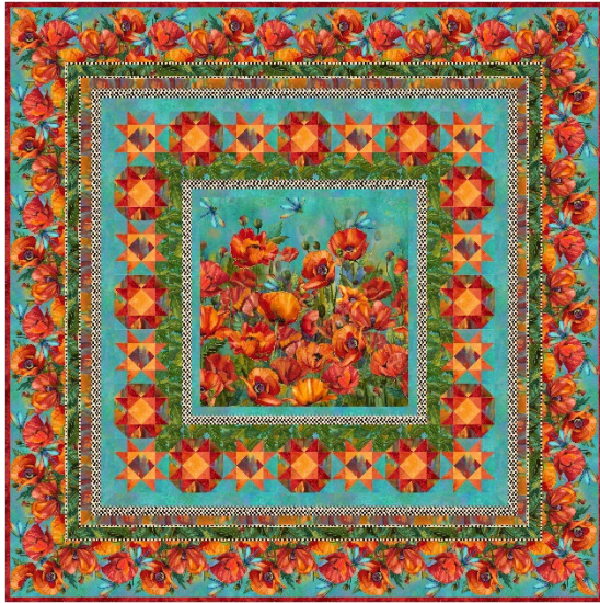
Figure 21 Large Quilt