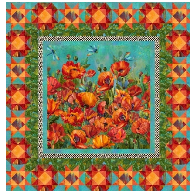
Figure 18 Quilt Center