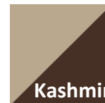
Figure 1a Kashmir /Funnel Cake HST