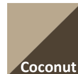
Figure 1b Coconut /Funnel Cake HST