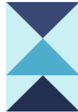
Figure 23 Middle Unit